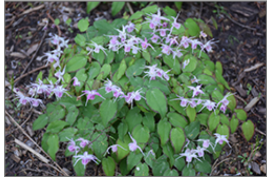
Queen Esta Bishop's Hat in bloom

Queen Esta Bishop's Hat is a dense herbaceous evergreen perennial with a ground-hugging habit of growth. Its medium texture blends into the garden, but can always be balanced by a couple of finer or coarser plants for an effective composition.