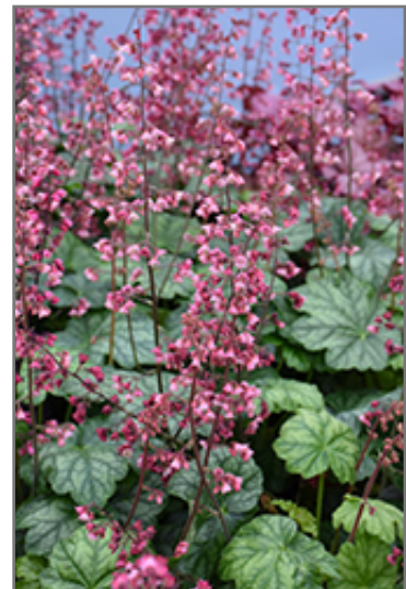
Berry Timeless Coral Bells flowers

We are so proud of the nursery stock that we have carefully selected for superior quality and performance, WE GUARANTEE ALL TREES, SHRUBS, EVERGREENS FOR 2 YEARS, AND ROSES FOR 1 YEAR!