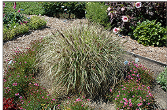
Ginger Love Fountain Grass

Ginger Love Fountain Grass is recommended for the following landscape applications;