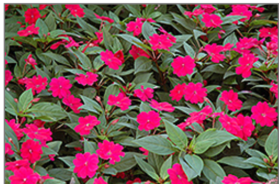
Bounce Cherry Impatiens in bloom

We are so proud of the nursery stock that we have carefully selected for superior quality and performance, WE GUARANTEE ALL TREES, SHRUBS, EVERGREENS FOR 2 YEARS, AND ROSES FOR 1 YEAR!