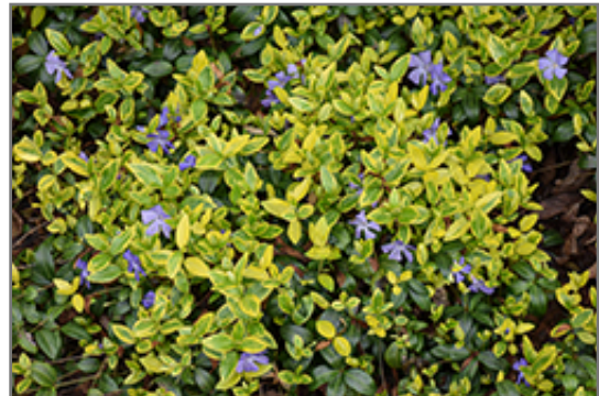
Illumination Periwinkle in bloom

Illumination Periwinkle is an herbaceous evergreen perennial with a ground-hugging habit of growth. Its medium texture blends into the garden, but can always be balanced by a couple of finer or coarser plants for an effective composition.