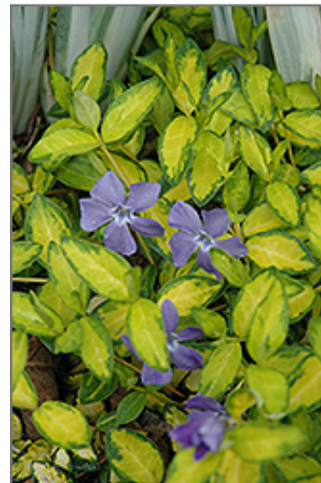
Illumination Periwinkle flowers

Illumination Periwinkle is a fine choice for the garden, but it is also a good selection for planting in outdoor pots and containers. Because of its spreading habit of growth, it is ideally suited for use as a 'spiller' in the 'spiller-thriller-filler' container combination; plant it near the edges where it can spill gracefully over the pot. Note that when growing plants in outdoor containers and baskets, they may require more frequent waterings than they would in the yard or garden. Be aware that in our climate, most plants cannot be expected to survive the winter if left in containers outdoors, and this plant is no exception. Contact our experts for more information on how to protect it over the winter months.