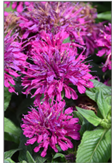
Grape Gumball Beebalm flowers

This variety forms a dense mound of purplish-pink flowers on well branched, strong stems, over lush dark green foliage that has an excellent resistance to powdery mildew; great for massing along borders