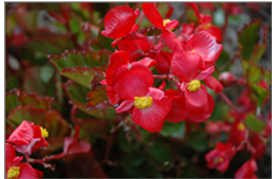
BabyWing Red Begonia flowers

BabyWing Red Begonia is a fine choice for the garden, but it is also a good selection for planting in outdoor containers and hanging baskets. It is often used as a 'filler' in the 'spiller-thriller-filler' container combination, providing a mass of flowers and foliage against which the thriller plants stand out. Note that when growing plants in outdoor containers and baskets, they may require more frequent waterings than they would in the yard or garden.