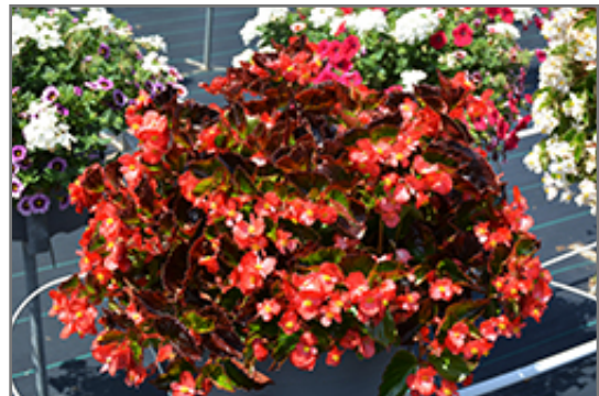
BabyWing Red Begonia in bloom

We are so proud of the nursery stock that we have carefully selected for superior quality and performance, WE GUARANTEE ALL TREES, SHRUBS, EVERGREENS FOR 2 YEARS, AND ROSES FOR 1 YEAR!