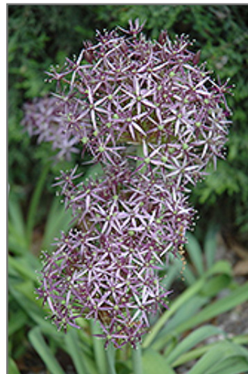
Star Of Persia Onion flowers

This is a relatively low maintenance plant, and should only be pruned after flowering to avoid removing any of the current season's flowers. It is a good choice for attracting butterflies to your yard, but is not particularly attractive to deer who tend to leave it alone in favor of tastier treats. It has no significant negative characteristics.