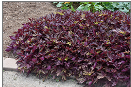
SolarPower Red Sweet Potato Vine

We are so proud of the nursery stock that we have carefully selected for superior quality and performance, WE GUARANTEE ALL TREES, SHRUBS, EVERGREENS FOR 2 YEARS, AND ROSES FOR 1 YEAR!