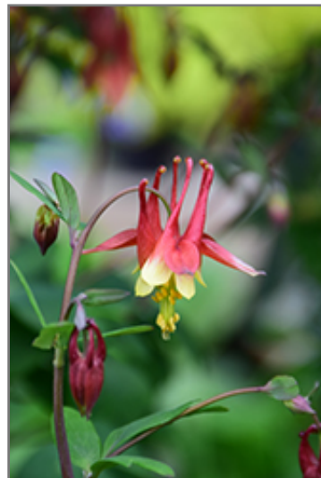
Wild Red Columbine flowers

This plant will require occasional maintenance and upkeep, and should be cut back in late fall in preparation for winter. Deer don't particularly care for this plant and will usually leave it alone in favor of tastier treats. Gardeners should be aware of the following characteristic(s) that may warrant special consideration;