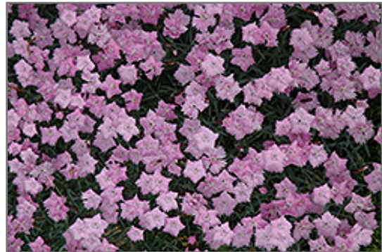
Bath's Pink Pinks in bloom

This is a relatively low maintenance plant, and is best cleaned up in early spring before it resumes active growth for the season. It is a good choice for attracting bees and butterflies to your yard, but is not particularly attractive to deer who tend to leave it alone in favor of tastier treats. It has no significant negative characteristics.