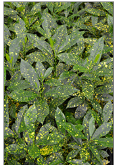
Gold Dust Variegated Croton foliage

We are so proud of the nursery stock that we have carefully selected for superior quality and performance, WE GUARANTEE ALL TREES, SHRUBS, EVERGREENS FOR 2 YEARS, AND ROSES FOR 1 YEAR!