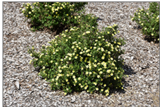
Lemon Meringue Potentilla in bloom

We are so proud of the nursery stock that we have carefully selected for superior quality and performance, WE GUARANTEE ALL TREES, SHRUBS, EVERGREENS FOR 2 YEARS, AND ROSES FOR 1 YEAR!