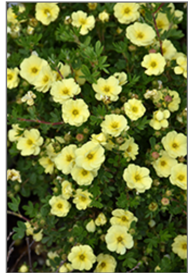
Lemon Meringue Potentilla flowers

Lemon Meringue Potentilla is a dense multi-stemmed deciduous shrub with a ground-hugging habit of growth. Its relatively fine texture sets it apart from other landscape plants with less refined foliage.