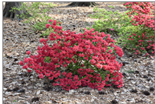
Girard's Crimson Azalea in bloom

We are so proud of the nursery stock that we have carefully selected for superior quality and performance, WE GUARANTEE ALL TREES, SHRUBS, EVERGREENS FOR 2 YEARS, AND ROSES FOR 1 YEAR!