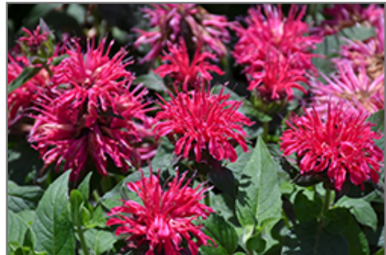
Balmy Rose Beebalm flowers

Balmy Rose Beebalm is an herbaceous perennial with a mounded form. Its medium texture blends into the garden, but can always be balanced by a couple of finer or coarser plants for an effective composition.