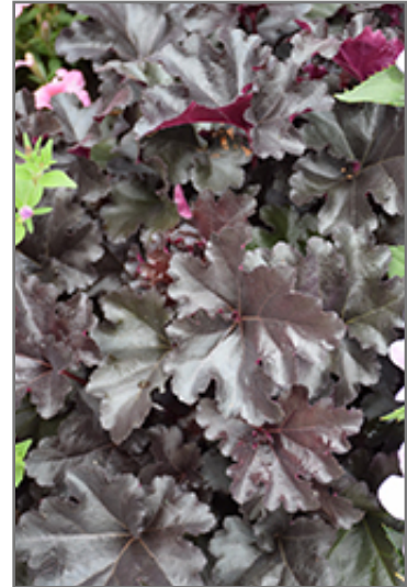
Black Pearl Coral Bells foliage

Black Pearl Coral Bells is a dense herbaceous evergreen perennial with tall flower stalks held atop a low mound of foliage. Its relatively fine texture sets it apart from other garden plants with less refined foliage.