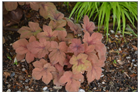
Pumpkin Spice Foamy Bells

We are so proud of the nursery stock that we have carefully selected for superior quality and performance, WE GUARANTEE ALL TREES, SHRUBS, EVERGREENS FOR 2 YEARS, AND ROSES FOR 1 YEAR!