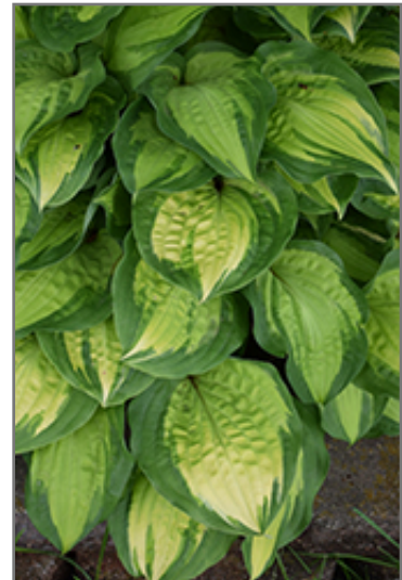
Island Breeze Hosta foliage

Island Breeze Hosta is a dense herbaceous perennial with tall flower stalks held atop a low mound of foliage. Its medium texture blends into the garden, but can always be balanced by a couple of finer or coarser plants for an effective composition.