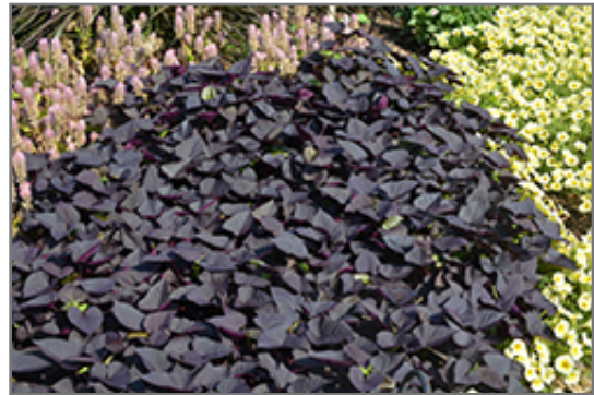
Sweet Caroline Sweetheart Jet Black Sweet Potato Vine

Sweet Caroline Sweetheart Jet Black Sweet Potato Vine is a dense herbaceous annual with a trailing habit of growth, eventually spilling over the edges of hanging baskets and containers. Its medium texture blends into the garden, but can always be balanced by a couple of finer or coarser plants for an effective composition.