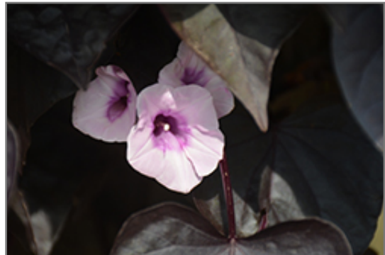
Sweet Caroline Sweetheart Jet Black Sweet Potato Vine flowers

Sweet Caroline Sweetheart Jet Black Sweet Potato Vine is a fine choice for the garden, but it is also a good selection for planting in outdoor containers and hanging baskets. Because of its trailing habit of growth, it is ideally suited for use as a 'spiller' in the 'spiller-thriller-filler' container combination; plant it near the edges where it can spill gracefully over the pot. Note that when growing plants in outdoor containers and baskets, they may require more frequent waterings than they would in the yard or garden.