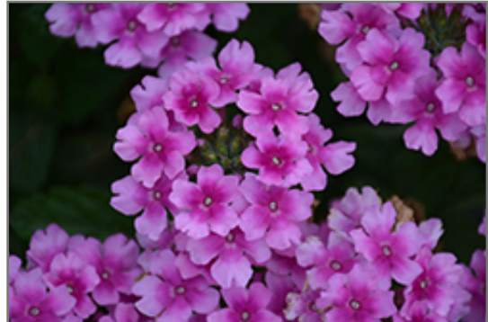
EnduraScape Pink Bicolor Verbena flowers

EnduraScape Pink Bicolor Verbena is an herbaceous annual with a trailing habit of growth, eventually spilling over the edges of hanging baskets and containers. It brings an extremely fine and delicate texture to the garden composition and should be used to full effect.