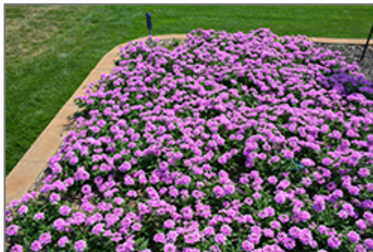
EnduraScape Pink Bicolor Verbena in bloom