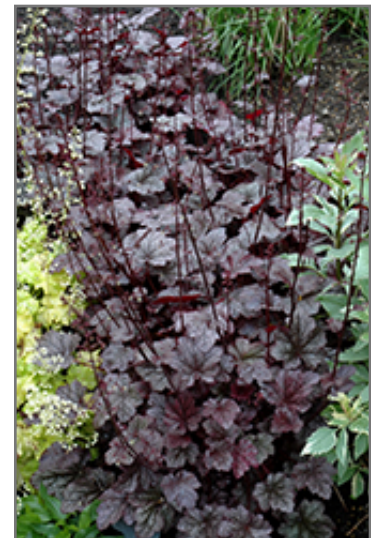
Plum Pudding Coral Bells in bloom

We are so proud of the nursery stock that we have carefully selected for superior quality and performance, WE GUARANTEE ALL TREES, SHRUBS, EVERGREENS FOR 2 YEARS, AND ROSES FOR 1 YEAR!