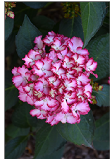
Seaside Serenade Fire Island Hydrangea flowers

We are so proud of the nursery stock that we have carefully selected for superior quality and performance, WE GUARANTEE ALL TREES, SHRUBS, EVERGREENS FOR 2 YEARS, AND ROSES FOR 1 YEAR!