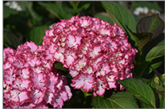
Seaside Serenade Fire Island Hydrangea flowers

Seaside Serenade Fire Island Hydrangea is a multi-stemmed deciduous shrub with a more or less rounded form. Its relatively coarse texture can be used to stand it apart from other landscape plants with finer foliage.