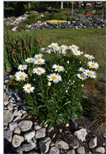
Becky Shasta Daisy in bloom

Becky Shasta Daisy is a fine choice for the garden, but it is also a good selection for planting in outdoor pots and containers. Because of its height, it is often used as a 'thriller' in the 'spiller-thriller-filler' container combination; plant it near the center of the pot, surrounded by smaller plants and those that spill over the edges. It is even sizeable enough that it can be grown alone in a suitable container. Note that when growing plants in outdoor containers and baskets, they may require more frequent waterings than they would in the yard or garden. Be aware that in our climate, most plants cannot be expected to survive the winter if left in containers outdoors, and this plant is no exception. Contact our experts for more information on how to protect it over the winter months.