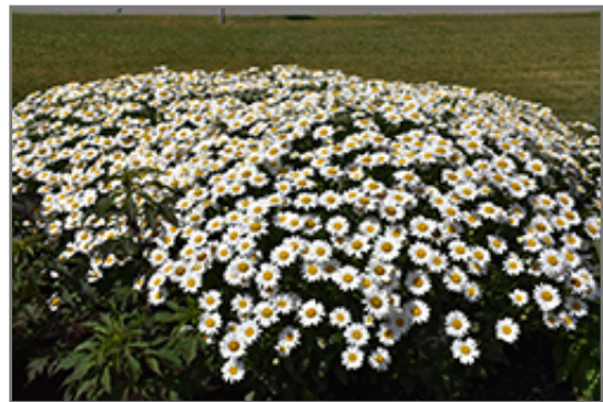
Becky Shasta Daisy in bloom

We are so proud of the nursery stock that we have carefully selected for superior quality and performance, WE GUARANTEE ALL TREES, SHRUBS, EVERGREENS FOR 2 YEARS, AND ROSES FOR 1 YEAR!