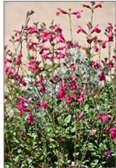
Mirage Hot Pink Autumn Sage flowers

Mirage Hot Pink Autumn Sage is a fine choice for the garden, but it is also a good selection for planting in outdoor pots and containers. It is often used as a 'filler' in the 'spiller-thriller-filler' container combination, providing a mass of flowers against which the larger thriller plants stand out. Note that when growing plants in outdoor containers and baskets, they may require more frequent waterings than they would in the yard or garden.