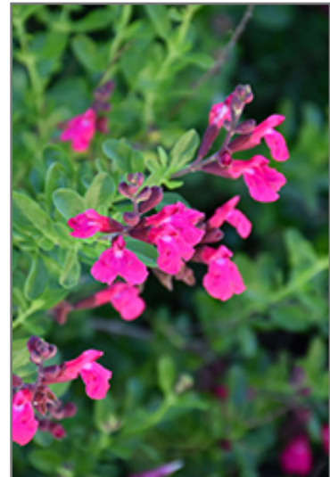
Mirage Hot Pink Autumn Sage flowers

Mirage Hot Pink Autumn Sage is an herbaceous annual with an upright spreading habit of growth. Its medium texture blends into the garden, but can always be balanced by a couple of finer or coarser plants for an effective composition.