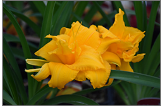
Condilla Daylily flowers

A stunning re-blooming beauty, presenting vibrant, golden-yellow double blooms with ruffled edges; great grassy texture and form; a color addition to the garden or border that really stands out