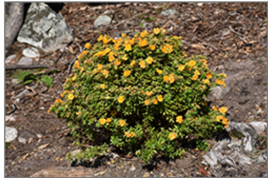
Marmalade Potentilla in bloom

This shrub does best in full sun to partial shade. It is very adaptable to both dry and moist locations, and should do just fine under typical garden conditions. It is considered to be drought-tolerant, and thus makes an ideal choice for a low-water garden or xeriscape application. It is not particular as to soil type or pH. It is highly tolerant of urban pollution and will even thrive in inner city environments. This is a selection of a native North American species.