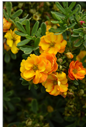
Marmalade Potentilla flowers

Marmalade Potentilla is a dense multi-stemmed deciduous shrub with a more or less rounded form. Its relatively fine texture sets it apart from other landscape plants with less refined foliage.