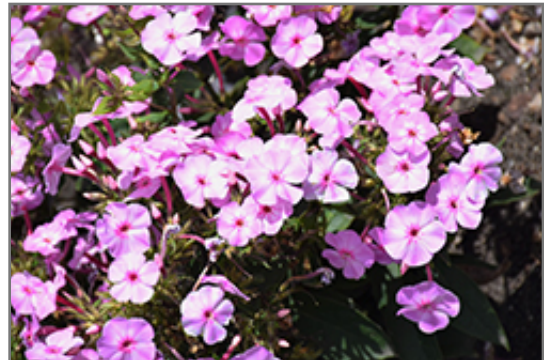
Garden Girls Uptown Girl Garden Phlox flowers

Garden Girls Uptown Girl Garden Phlox is recommended for the following landscape applications;