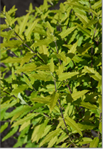
La Barbe Bleue Caryopteris foliage