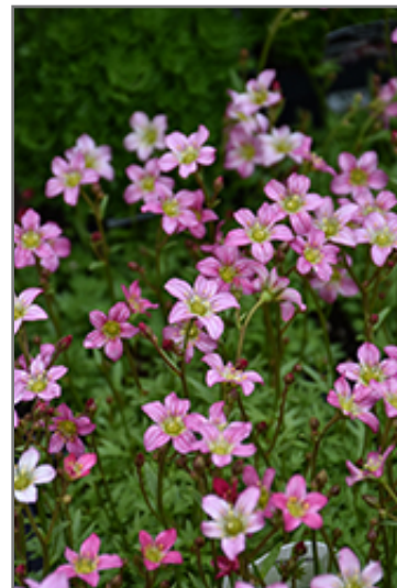
Touran Pink Saxifrage flowers

This plant will require occasional maintenance and upkeep, and should not require much pruning, except when necessary, such as to remove dieback. It has no significant negative characteristics.