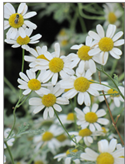
German Chamomile flowers

We are so proud of the nursery stock that we have carefully selected for superior quality and performance, WE GUARANTEE ALL TREES, SHRUBS, EVERGREENS FOR 2 YEARS, AND ROSES FOR 1 YEAR!