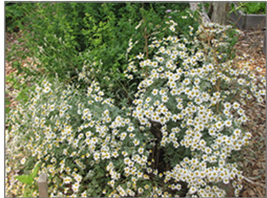
German Chamomile

German Chamomile will grow to be about 24 inches tall at maturity, with a spread of 18 inches. It grows at a fast rate, and under ideal conditions can be expected to live for approximately 5 years. As an herbaceous perennial, this plant will usually die back to the crown each winter, and will regrow from the base each spring. Be careful not to disturb the crown in late winter when it may not be readily seen!