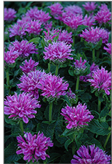
Petite Delight Beebalm flowers