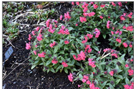
Shrimps On The Barbie Lungwort in bloom

We are so proud of the nursery stock that we have carefully selected for superior quality and performance, WE GUARANTEE ALL TREES, SHRUBS, EVERGREENS FOR 2 YEARS, AND ROSES FOR 1 YEAR!