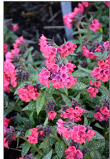
Shrimps On The Barbie Lungwort flowers

Shrimps On The Barbie Lungwort is an herbaceous perennial with a mounded form. Its medium texture blends into the garden, but can always be balanced by a couple of finer or coarser plants for an effective composition.