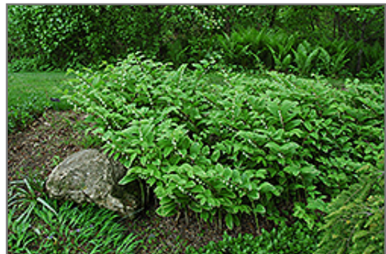
Variegated Solomon's Seal in bloom

We are so proud of the nursery stock that we have carefully selected for superior quality and performance, WE GUARANTEE ALL TREES, SHRUBS, EVERGREENS FOR 2 YEARS, AND ROSES FOR 1 YEAR!