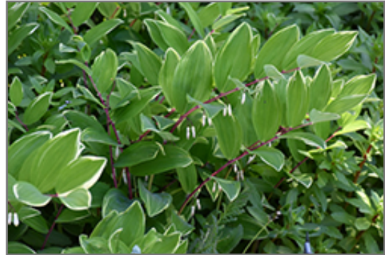
Variegated Solomon's Seal flowers

Variegated Solomon's Seal is recommended for the following landscape applications;