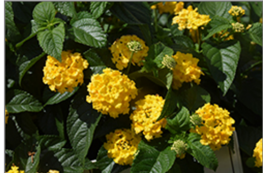
Lucky Yellow Lantana flowers

Lucky Yellow Lantana is recommended for the following landscape applications;