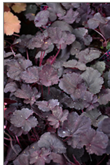
Black Forest Cake Coral Bells foliage

We are so proud of the nursery stock that we have carefully selected for superior quality and performance, WE GUARANTEE ALL TREES, SHRUBS, EVERGREENS FOR 2 YEARS, AND ROSES FOR 1 YEAR!