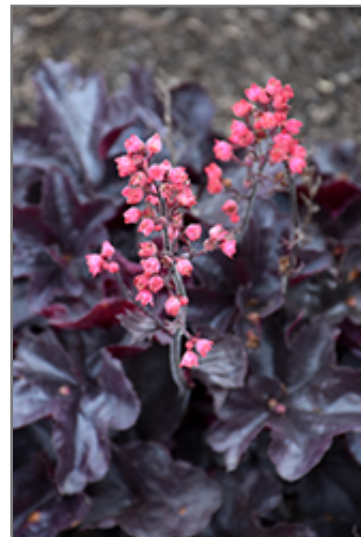
Black Forest Cake Coral Bells flowers

Black Forest Cake Coral Bells is a dense herbaceous evergreen perennial with tall flower stalks held atop a low mound of foliage. Its relatively fine texture sets it apart from other garden plants with less refined foliage.