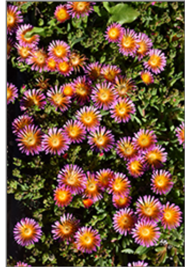
Ocean Sunset Orange Glow Ice Plant flowers

Ocean Sunset Orange Glow Ice Plant is a fine choice for the garden, but it is also a good selection for planting in outdoor pots and containers. Because of its spreading habit of growth, it is ideally suited for use as a 'spiller' in the 'spiller-thriller-filler' container combination; plant it near the edges where it can spill gracefully over the pot. Note that when growing plants in outdoor containers and baskets, they may require more frequent waterings than they would in the yard or garden. Be aware that in our climate, most plants cannot be expected to survive the winter if left in containers outdoors, and this plant is no exception. Contact our experts for more information on how to protect it over the winter months.