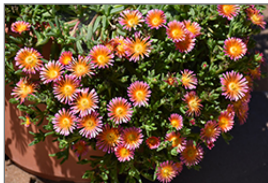
Ocean Sunset Orange Glow Ice Plant flowers

We are so proud of the nursery stock that we have carefully selected for superior quality and performance, WE GUARANTEE ALL TREES, SHRUBS, EVERGREENS FOR 2 YEARS, AND ROSES FOR 1 YEAR!