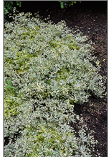
Golden Feathers Jacob's Ladder foliage

This is a relatively low maintenance plant, and is best cleaned up in early spring before it resumes active growth for the season. Deer don't particularly care for this plant and will usually leave it alone in favor of tastier treats. It has no significant negative characteristics.