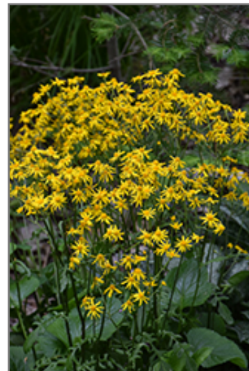
Golden Ragwort flowers