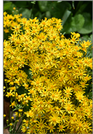
Golden Ragwort flowers

Golden Ragwort is an herbaceous perennial with an upright spreading habit of growth. Its relatively coarse texture can be used to stand it apart from other garden plants with finer foliage.