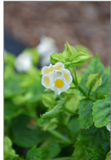
Kauai Lemon Drop Torenia flowers

Kauai Lemon Drop Torenia is an herbaceous annual with a mounded form. Its relatively fine texture sets it apart from other garden plants with less refined foliage.