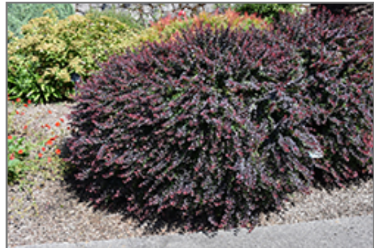
Royal Burgundy Japanese Barberry

We are so proud of the nursery stock that we have carefully selected for superior quality and performance, WE GUARANTEE ALL TREES, SHRUBS, EVERGREENS FOR 2 YEARS, AND ROSES FOR 1 YEAR!