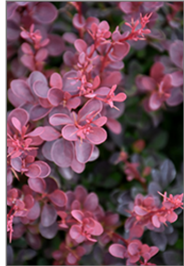
Royal Burgundy Japanese Barberry foliage

Royal Burgundy Japanese Barberry is a dense multi-stemmed deciduous shrub with a mounded form. It lends an extremely fine and delicate texture to the landscape composition which should be used to full effect.