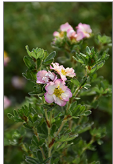
Happy Face Hearts Potentilla flowers

We are so proud of the nursery stock that we have carefully selected for superior quality and performance, WE GUARANTEE ALL TREES, SHRUBS, EVERGREENS FOR 2 YEARS, AND ROSES FOR 1 YEAR!