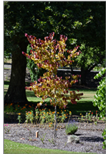
Flame Thrower Redbud

This tree does best in full sun to partial shade. It prefers to grow in average to moist conditions, and shouldn't be allowed to dry out. To help this plant achieve its best flowering performance, periodically apply a flower-boosting fertilizer from early spring through into the active growing season. It is not particular as to soil type or pH. It is highly tolerant of urban pollution and will even thrive in inner city environments, and will benefit from being planted in a relatively sheltered location. Consider applying a thick mulch around the root zone in winter to protect it in exposed locations or colder microclimates. This is a selection of a native North American species.