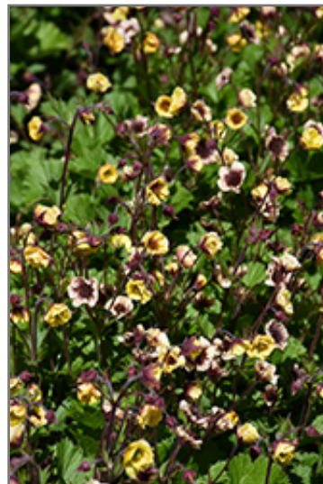
Tempo Yellow Avens flowers

This is a relatively low maintenance plant, and should be cut back in late fall in preparation for winter. It is a good choice for attracting butterflies to your yard, but is not particularly attractive to deer who tend to leave it alone in favor of tastier treats. It has no significant negative characteristics.