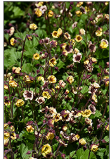
Tempo Yellow Avers flowers

This is a relatively low maintenance plant, and should be cut back in late fall in preparation for winter. It is a good choice for attracting butterflies to your yard, but is not particularly attractive to deer who tend to leave it alone in favor of tastier treats. It has no significant negative characteristics.