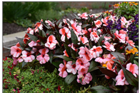
Clockwork Orange Stripe New Guinea Impatiens in bloom

We are so proud of the nursery stock that we have carefully selected for superior quality and performance, WE GUARANTEE ALL TREES, SHRUBS, EVERGREENS FOR 2 YEARS, AND ROSES FOR 1 YEAR!