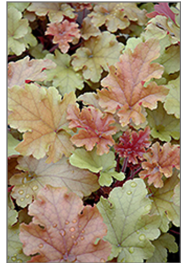
Marmalade Coral Bells foliage

Marmalade Coral Bells is a dense herbaceous evergreen perennial with tall flower stalks held atop a low mound of foliage. Its relatively fine texture sets it apart from other garden plants with less refined foliage.