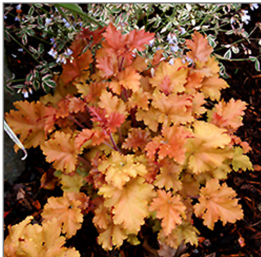
Marmalade Coral Bells foliage

Marmalade Coral Bells is a fine choice for the garden, but it is also a good selection for planting in outdoor pots and containers. It is often used as a 'filler' in the 'spiller-thriller-filler' container combination, providing a mass of flowers and foliage against which the larger thriller plants stand out. Note that when growing plants in outdoor containers and baskets, they may require more frequent waterings than they would in the yard or garden. Be aware that in our climate, most plants cannot be expected to survive the winter if left in containers outdoors, and this plant is no exception. Contact our experts for more information on how to protect it over the winter months.