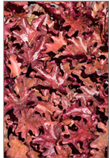
Peach Flambe Coral Bells foliage

Peach Flambe Coral Bells is a dense herbaceous evergreen perennial with tall flower stalks held atop a low mound of foliage. Its relatively fine texture sets it apart from other garden plants with less refined foliage.