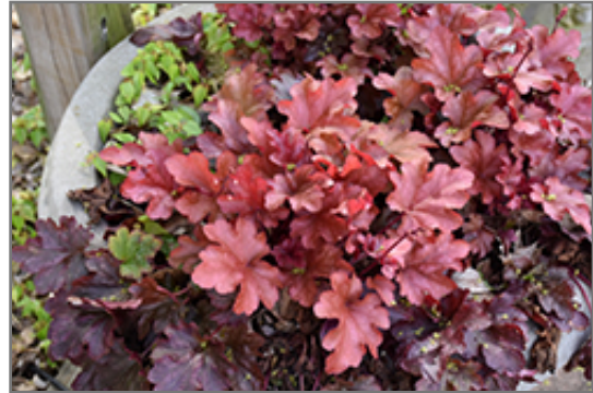
Peach Flambe Coral Bells