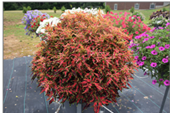
ColorBlaze Mini Me Watermelon Coleus

We are so proud of the nursery stock that we have carefully selected for superior quality and performance, WE GUARANTEE ALL TREES, SHRUBS, EVERGREENS FOR 2 YEARS, AND ROSES FOR 1 YEAR!