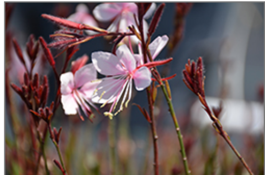
Steffi Blush Pink Gaura flowers

Steffi Blush Pink Gaura is an open herbaceous perennial with tall flower stalks held atop a low mound of foliage. It brings an extremely fine and delicate texture to the garden composition and should be used to full effect.