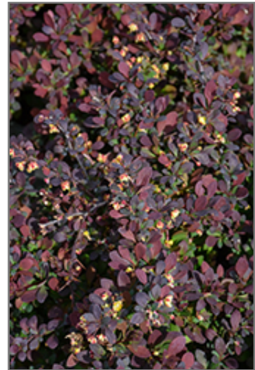
WorryFree Crimson Cutie Japanese Barberry foliage

WorryFree Crimson Cutie Japanese Barberry is recommended for the following landscape applications;