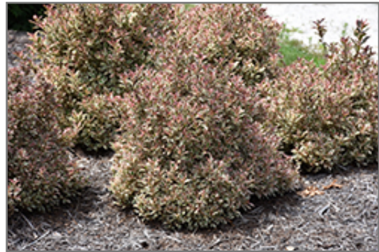
My Monet Weigela

My Monet Weigela will grow to be about 18 inches tall at maturity, with a spread of 18 inches. It tends to fill out right to the ground and therefore doesn't necessarily require facer plants in front. It grows at a medium rate, and under ideal conditions can be expected to live for approximately 30 years.